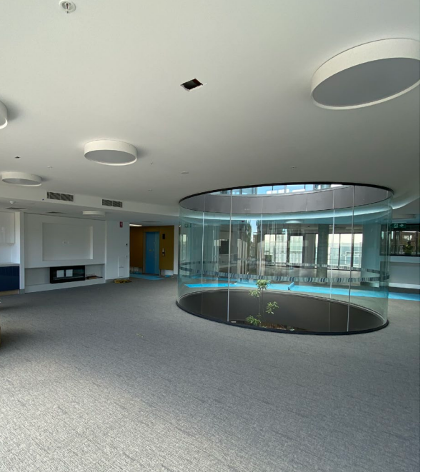
Feature planted glass atrium in Whitewater aged care lounge area

TLC Healthcare (TLC) is set to launch Australia's first multi-generational healthcare precinct, in less than a month. Located in beautiful bayside Mordialloc, this is the first time all service areas in which TLC operates are co-located at one site, bringing much-needed integrated healthcare services to the local community.